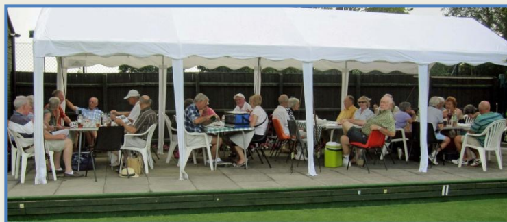
The marquee being put to good use

This decade has witnessed a number of changes in the fortunes of the club.