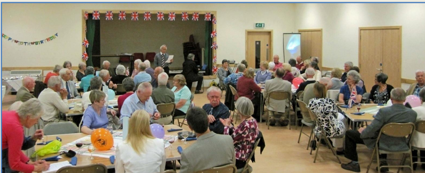
60th Anniversary celebration in the Village Hall

This decade commenced with a social in the Village Hall to celebrate our 60th Anniversary and finally witnessed the provision of a purpose built Tearoom! A marquee was also purchased to provide additional shelter from sun/rain. New ideas to raise money for the Tearoom included a Beetle Drive, a Race Night and an Open Spring Triples Competition. L.B.C. has always been fortunate to have social members and bowlers prepared to help with events by making tea, baking cakes, washing up etc!