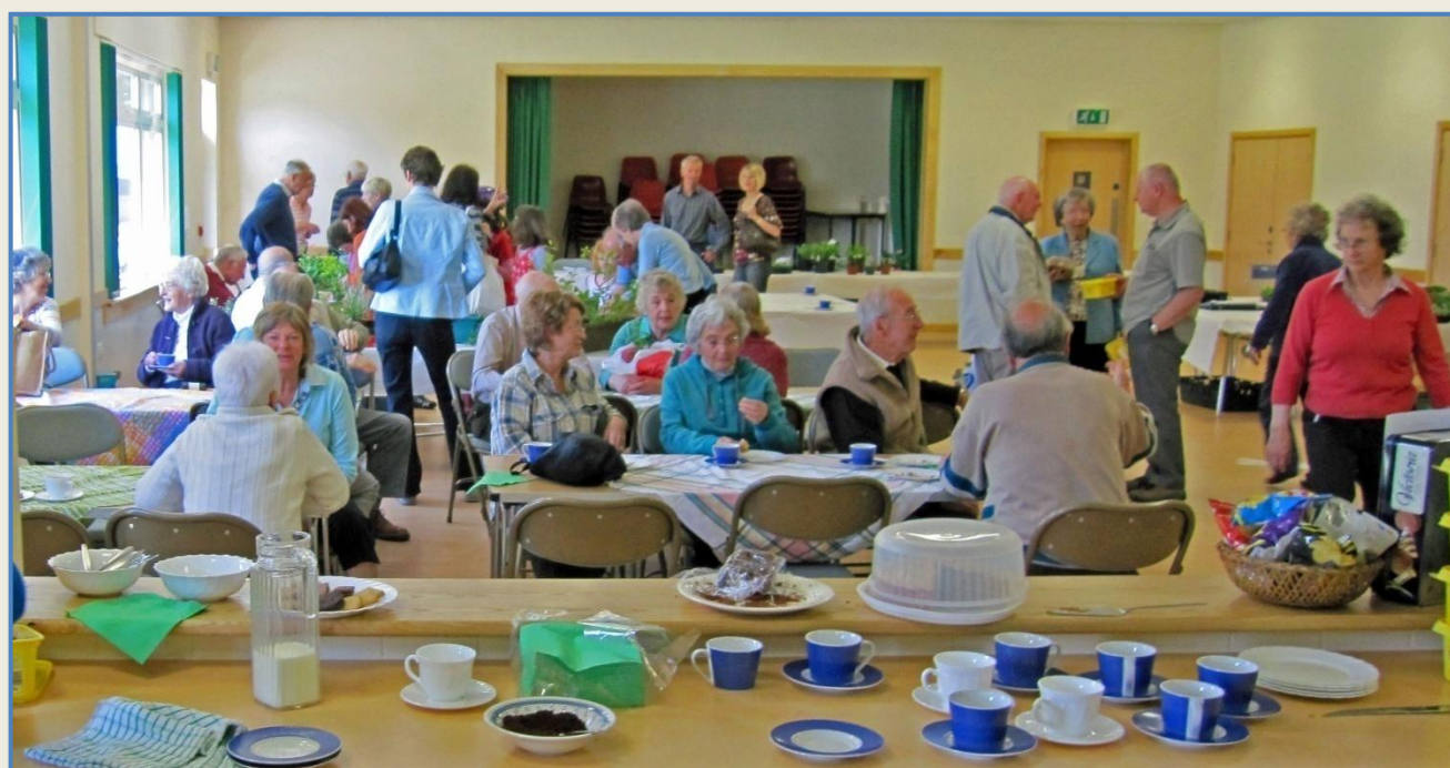
Below, taken in the new Village Hall in 2010, the event's popular refreshment area.