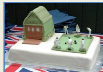
Mirella Vassallo's spectacular cakes!