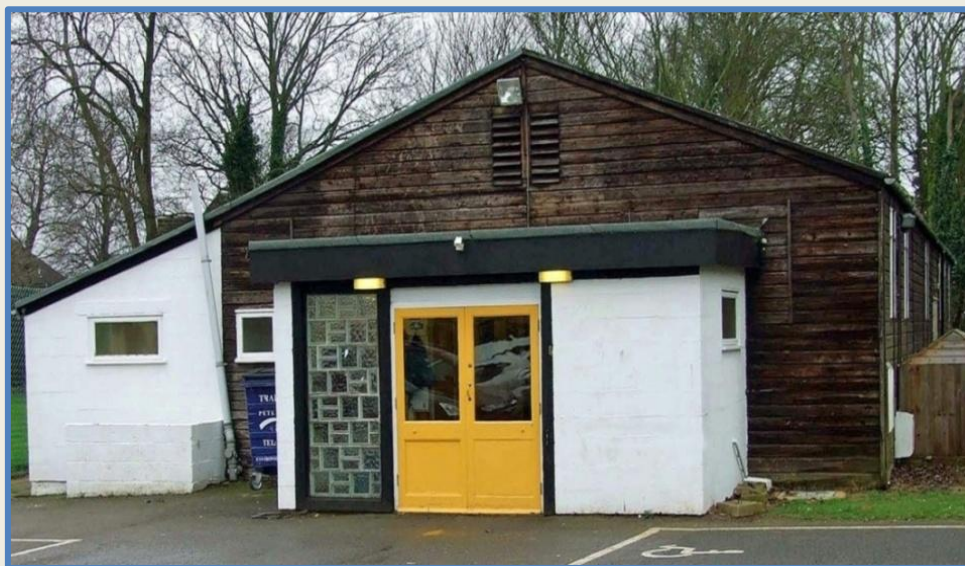
The Memorial Hall 1947 - 2008.