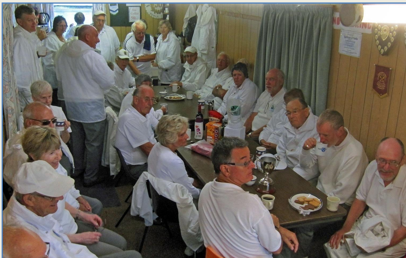
Picture above shows everyone having their tea in the old Tearoom after this event.