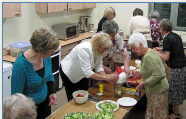
Busy in the kitchen